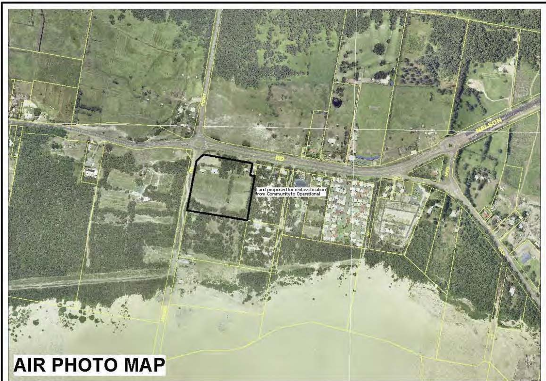
AIR PHOTO MAP