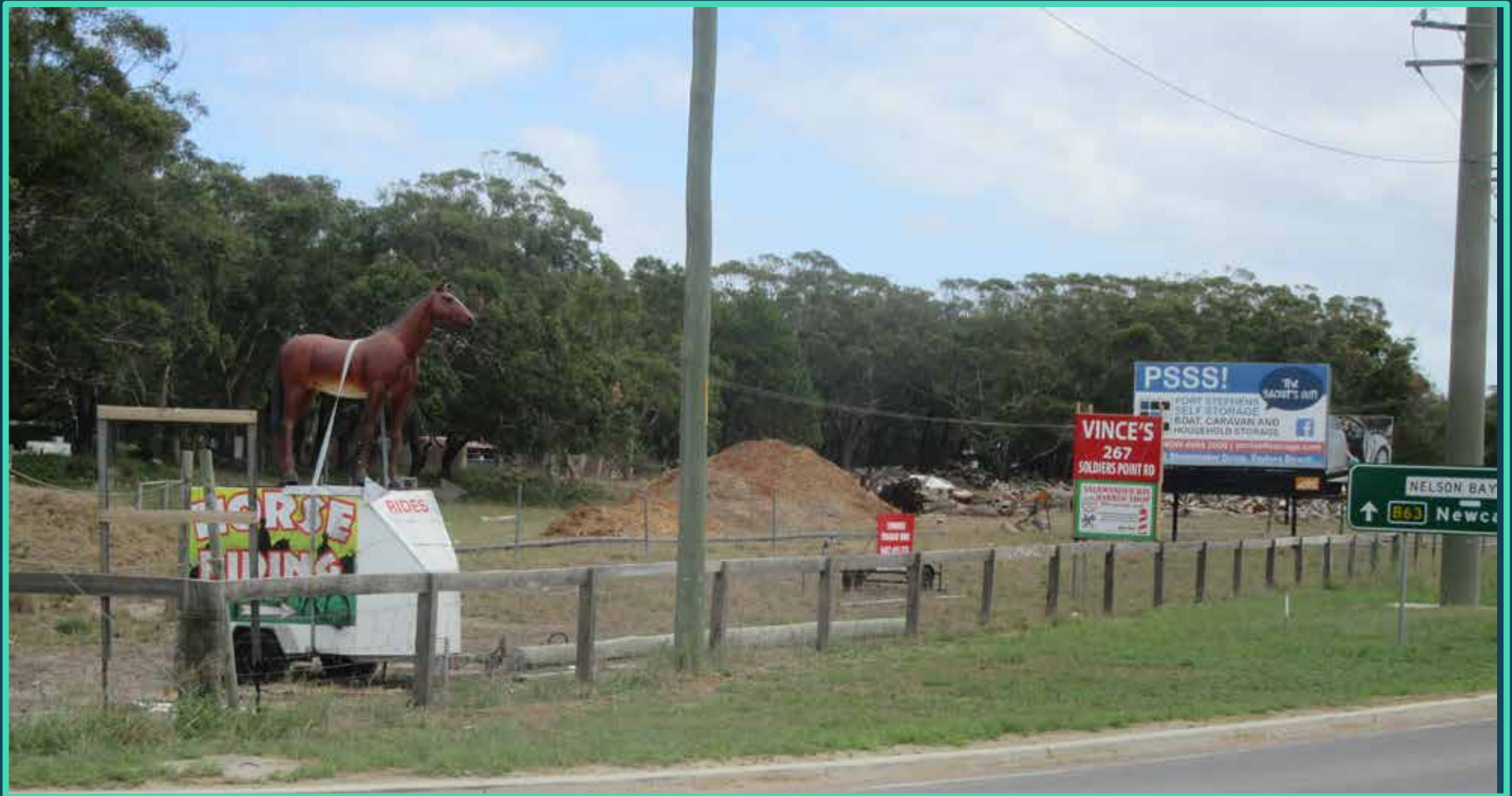
Nelson Bay Road and Signage