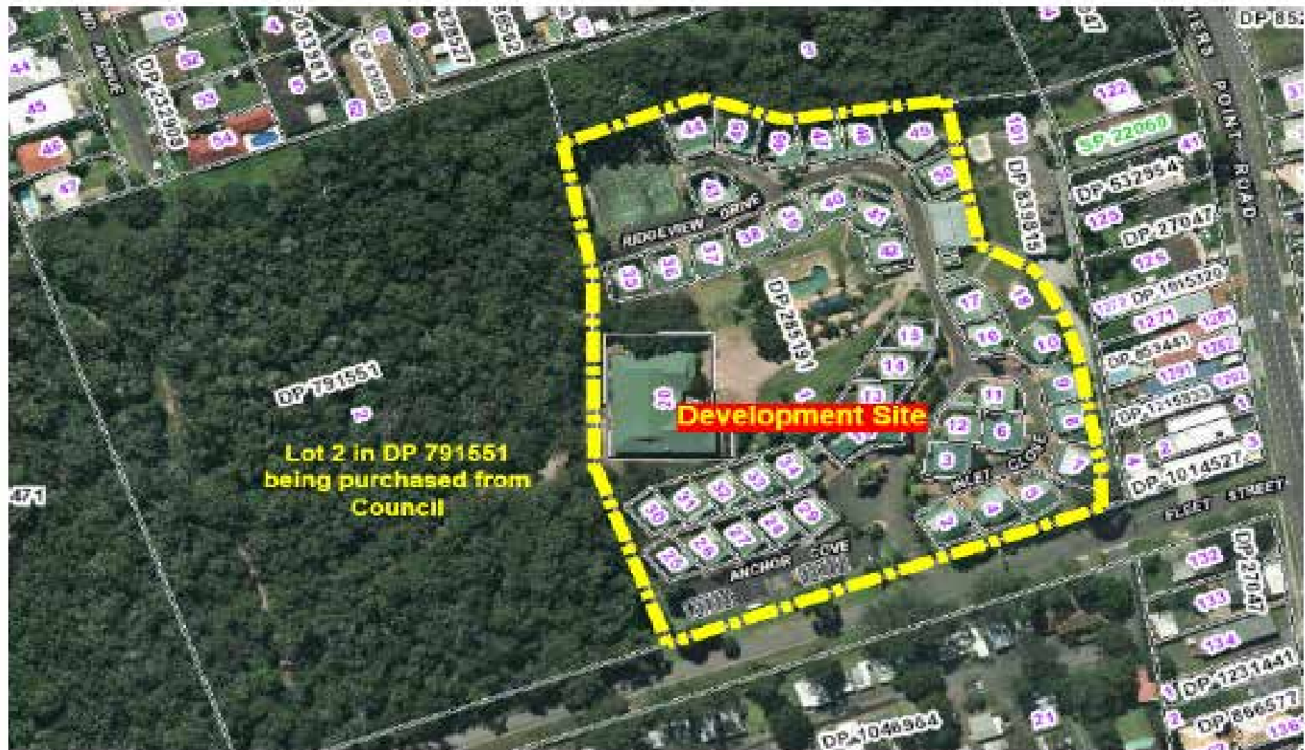
Figure 3 – Aerial Photograph of the Development Site