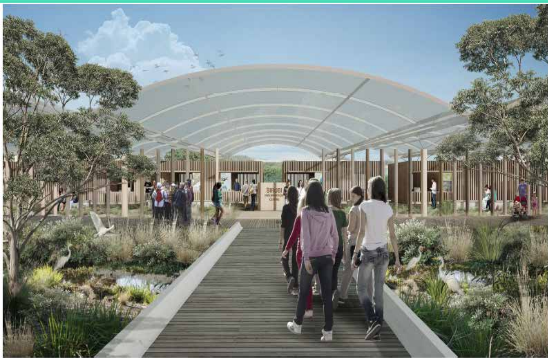
APPROACH FROM COACH DROP OFF