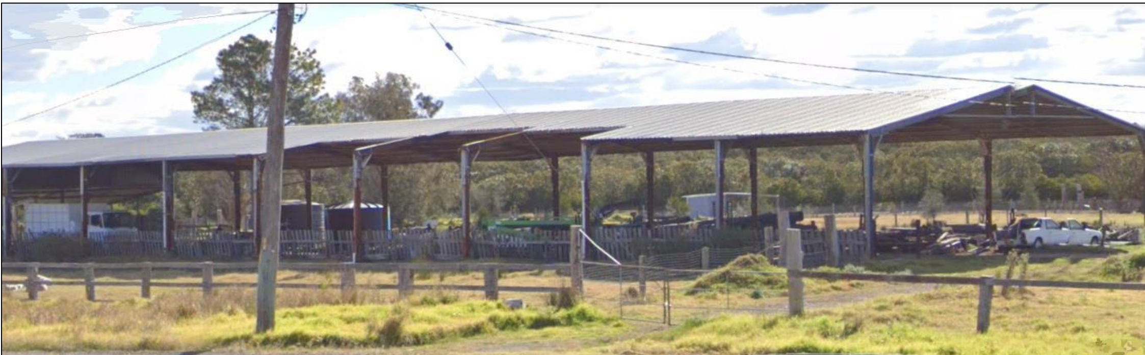
Barn on Nelson Bay Road, Salt Ash, with undisguised run-down equipment, vehicles and junk