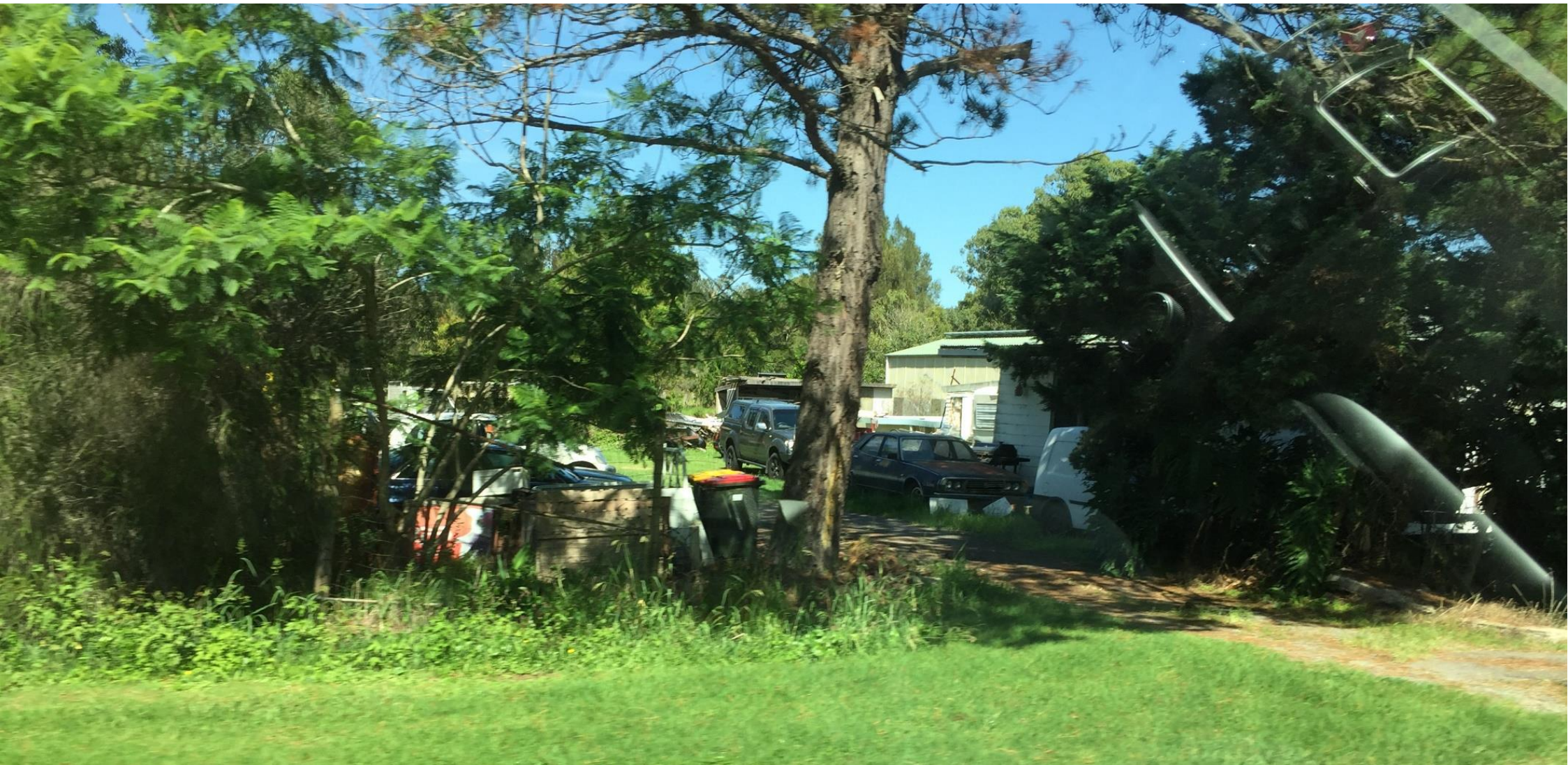
Car Wreckers Yard, Nelson Bay Road