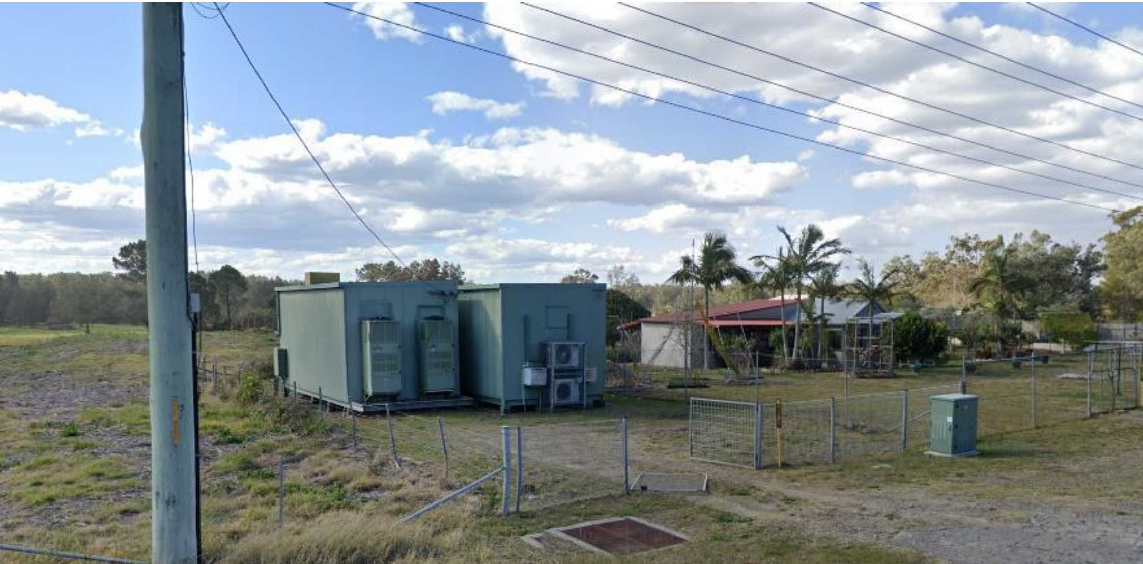
Utility Sheds near Anna Bay Turnoff