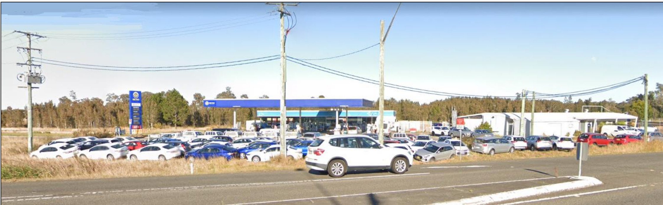
Entry to Newcastle Airport