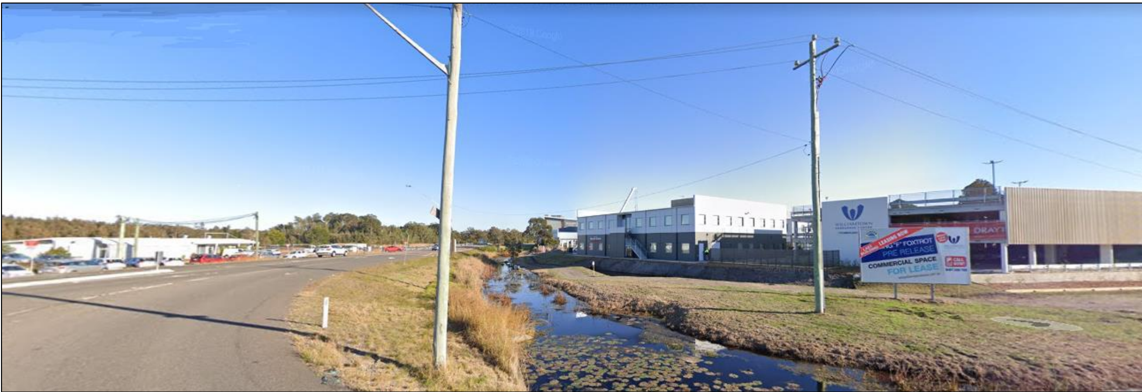
Airport - Gateway to Port Stephens Bluewater Paradise