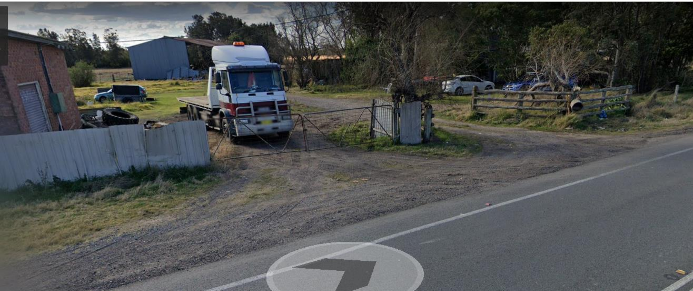
Nelson Bay Road