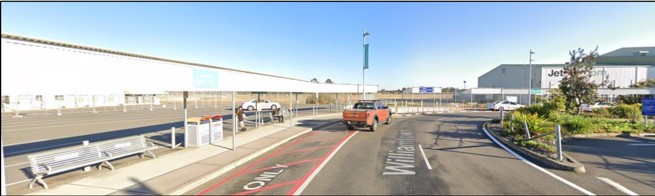
Bus Gateway to Port Stephens (and Newcastle) from Newcastle Airport