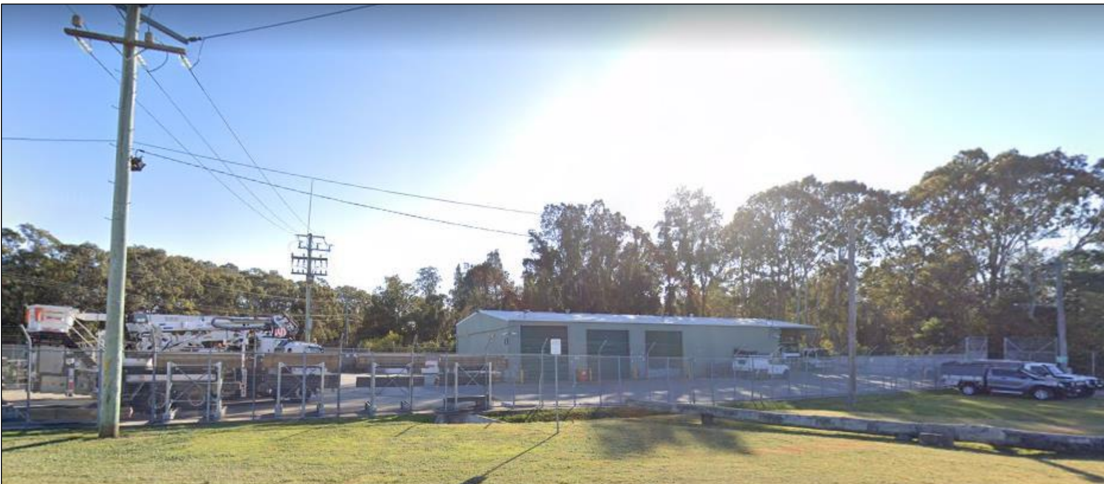
Storage Depot, Corner Nelson Bay and Lemon Tree Passage Roads