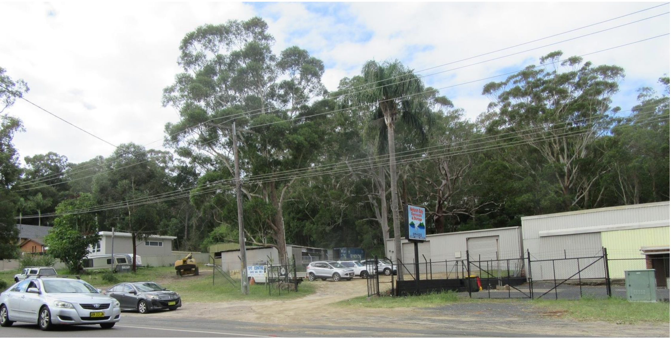
Light Industrial/Commercial Usage in Residential Zone at entrance to Nelson Bay