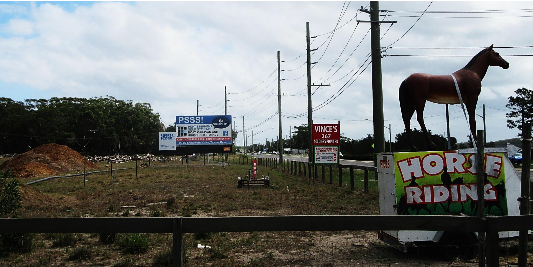
Corner of Nelson Bay Road and Jessie Street