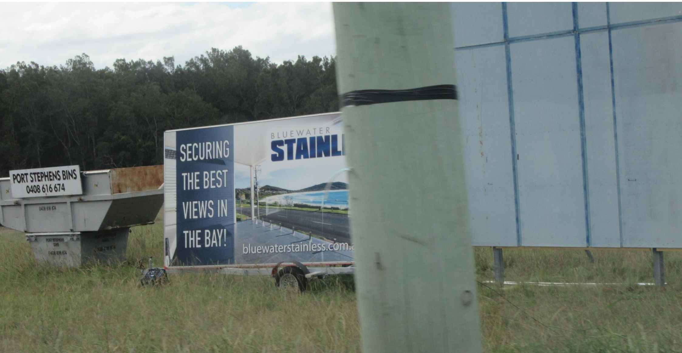
Advertising Signage, Nelson Bay Road