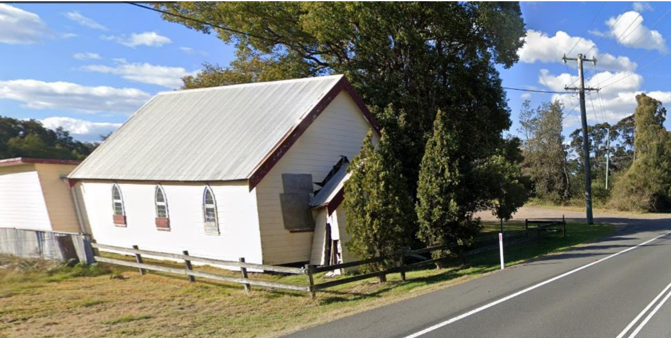
Damaged Church at 2115 Nelson Bay Road