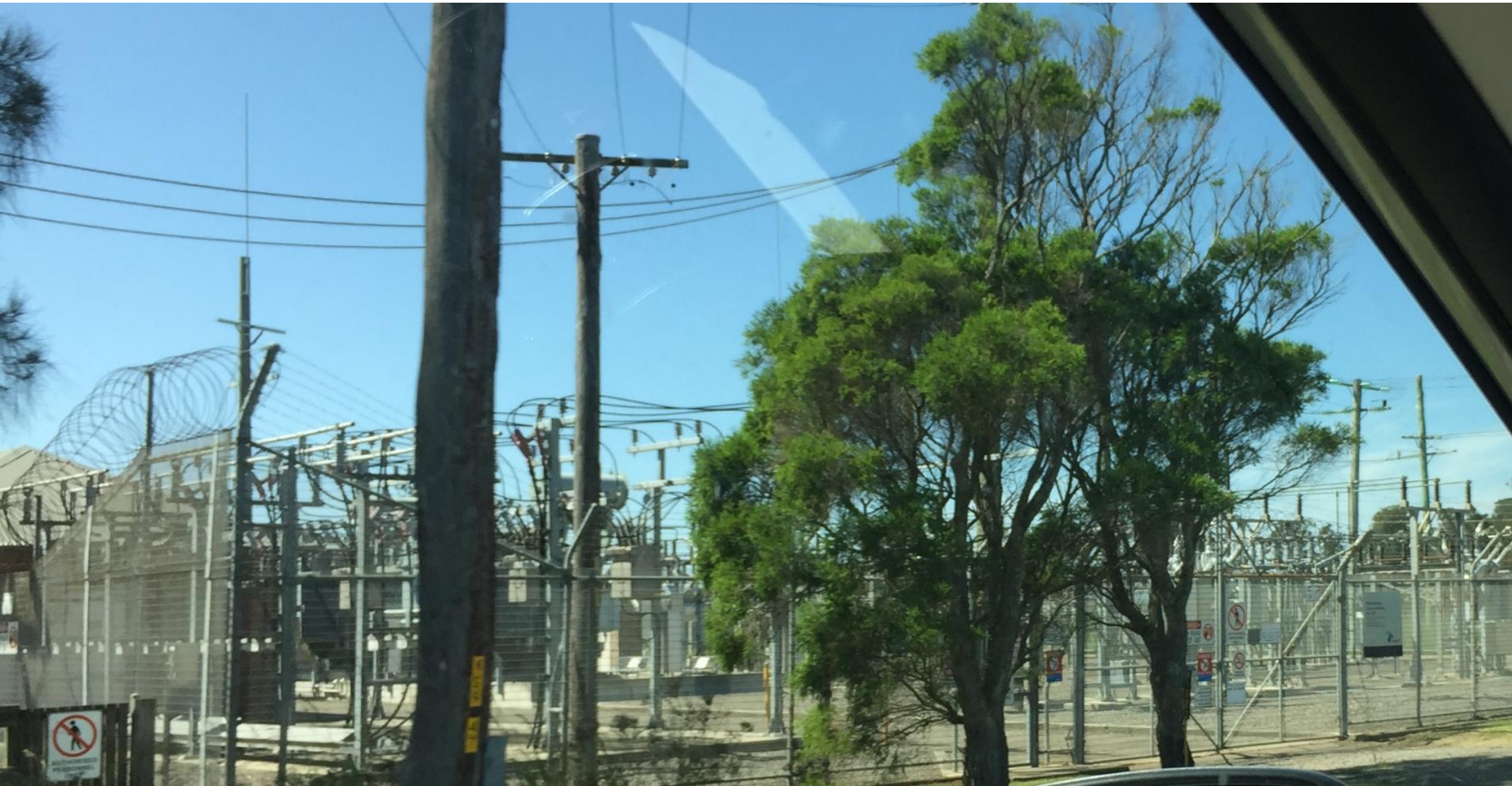
Electricity Sub-Station, Nelson Bay Road