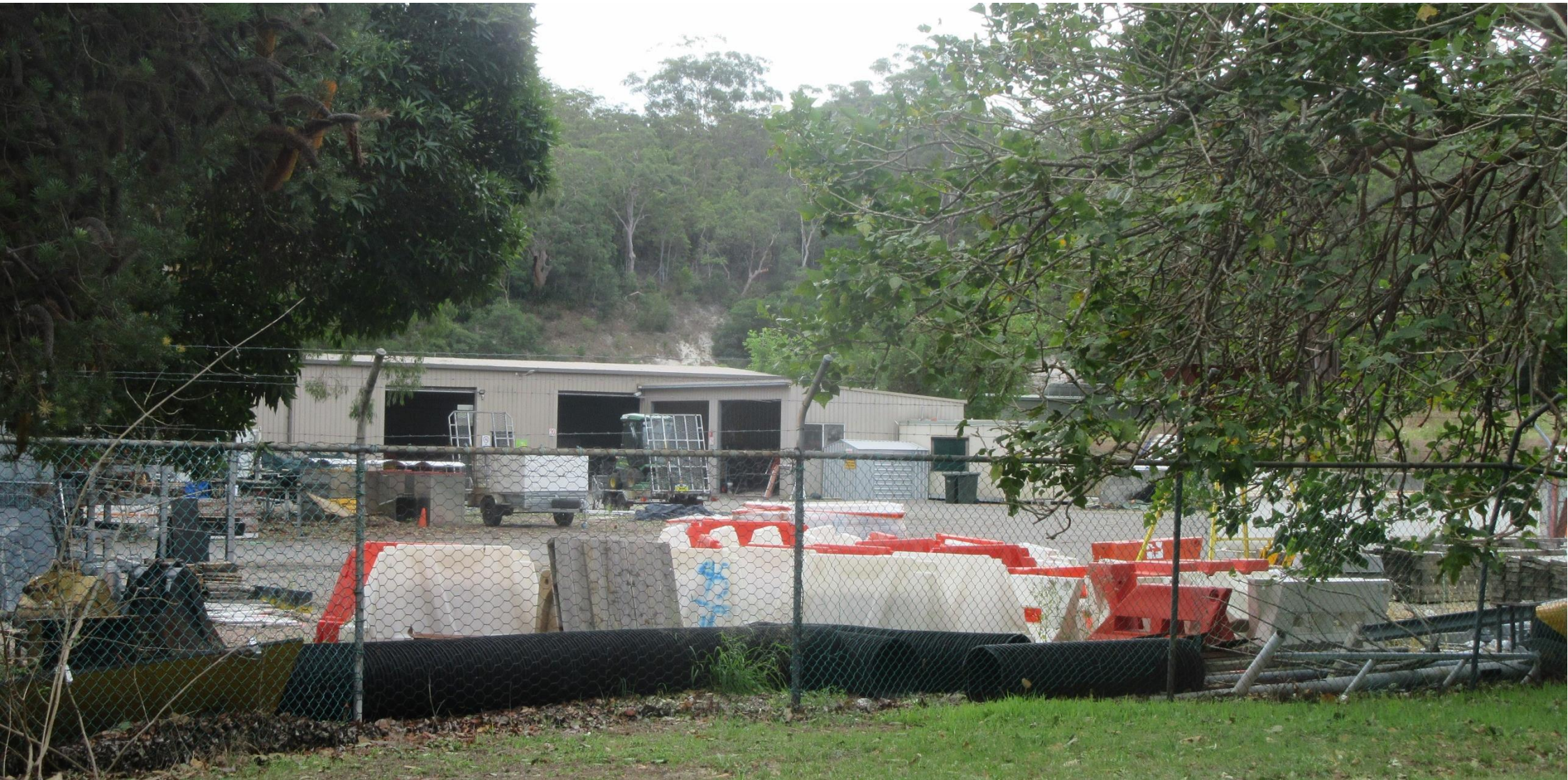
Council Depot, Nelson Bay Road